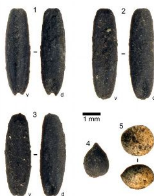
Fig. 3. Some weeds carpological material from Aparan III Early Bronze Age settlement. 1-3 - Lolium sp. , charred kernels, 4 - Rumex sp. , charred nutlet, 5 - Neslia sp. , mineralized capsule. Notes: v - ventral side, d - dorsal side.